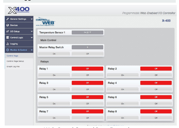
Web-Based Control Page Example