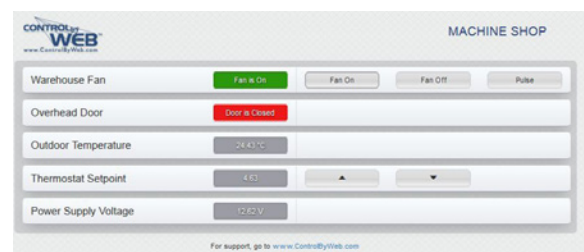
Example Control Page