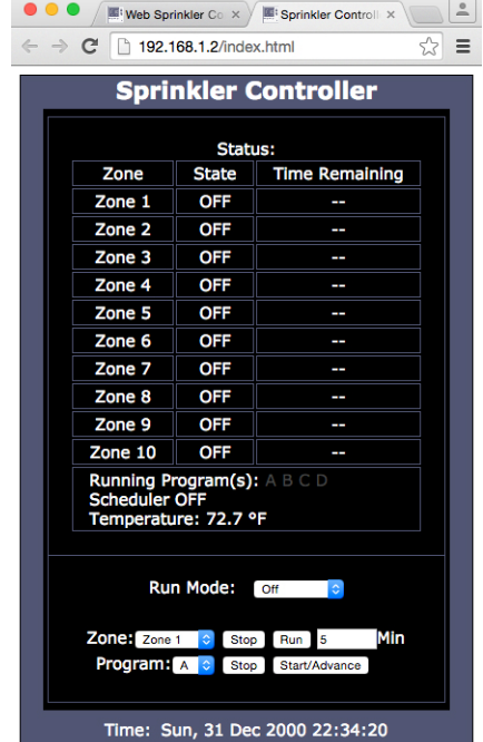
SmartStorm Control Page

*Note that accessing SmartStorm remotely over the Internet requires the installer to setup your router to forward incoming requests to SmartStorm.